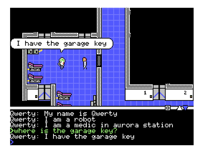
Figure 1: A screenshot of SHRDLU showing the main character talking with an NPC robot named Qwerty.

SHRDLU<sup>2</sup> is a sci-fi adventure game with a gameplay that borrows ideas from the early Sierra graphic adventure